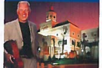
Calvin Gilmore Theatre