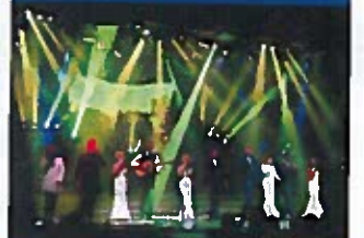
Fabulous Carolina Opry