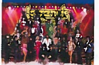
Exciting Legends in Concert